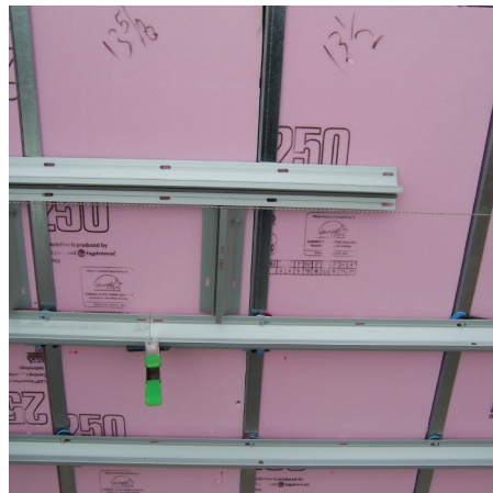
Step 5: Install Gridworx Channels over "Z" channels and rigid insulation