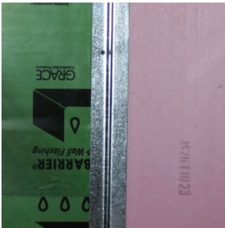
Step 4: Install "Z" channels and then Rigid Insulation between "Z" channels