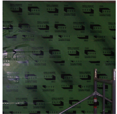
Step 3: Waterproofing Membrane