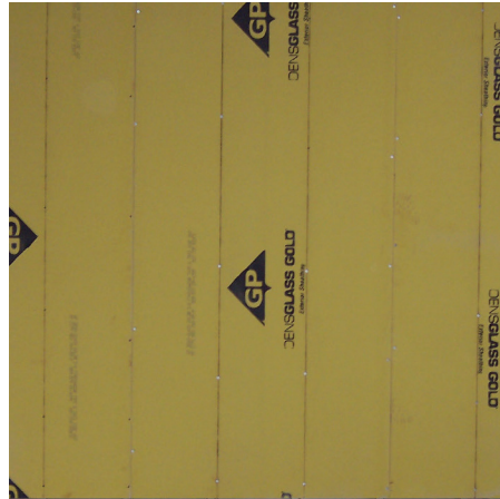
Step 2: Exterior Grade Sheathing