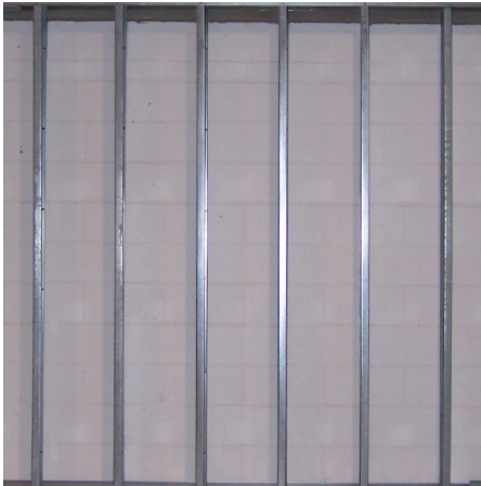
Step 1: Steel Studs