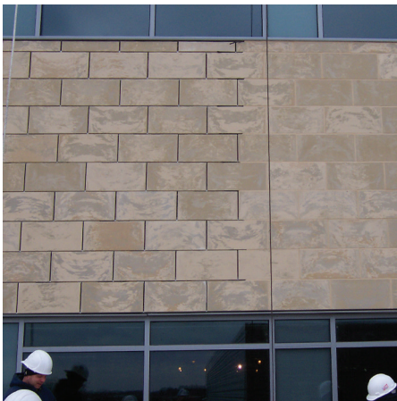
Step 7: Joints Sealed with Backer Rod and Silicone Sealant