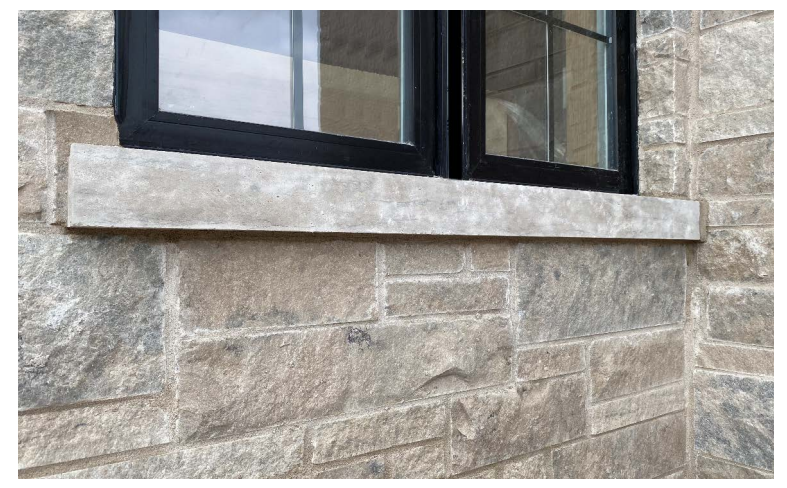
Glacial Sill with Adair® Georgian Blend