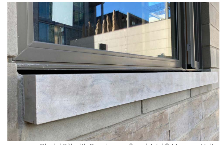
Glacial Sill with Renaissance® and Adair® Masonry Units