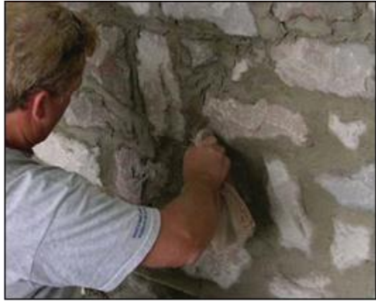
Use of burlap or a non-staining piece of carpet gives a softer finish around the stone edges creating a "bagged" or "carpet" joint.