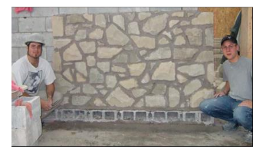
Even with the additional stone chiseling, the random lay-pattern allows the mason to maintain a high rate of production.

When fully cured this bagged joint blends into the stone giving a very rustic look.