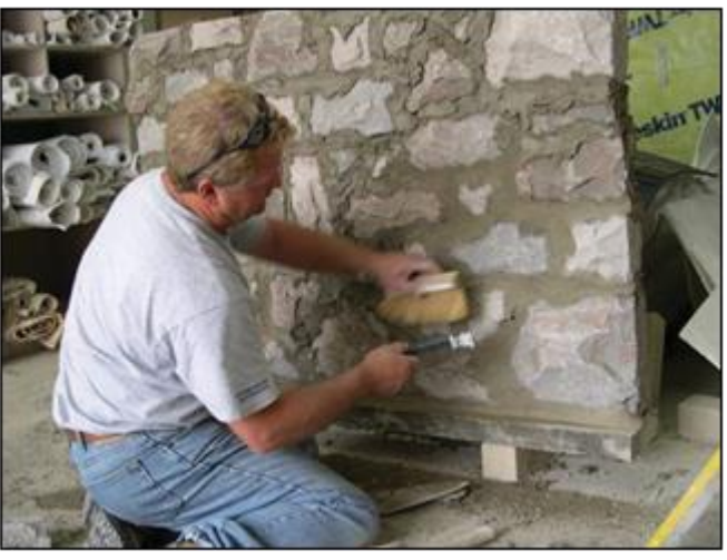
After tooling, brush excess mortar from the stone surfaces utilizing steel and soft fibre brushes.