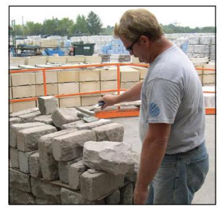
Break individual Old Mill stones into irregular shapes. Chisel back edges of broken surfaces to remove the excess "arris" of stone.

For a more rustic look, break off chunks the stone at the top right and bottom left.