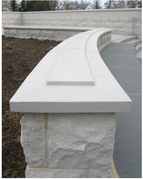
Delaware Valley College Life Sciences Building; Kimmel-Bogrette; ARRIS.cast Copings