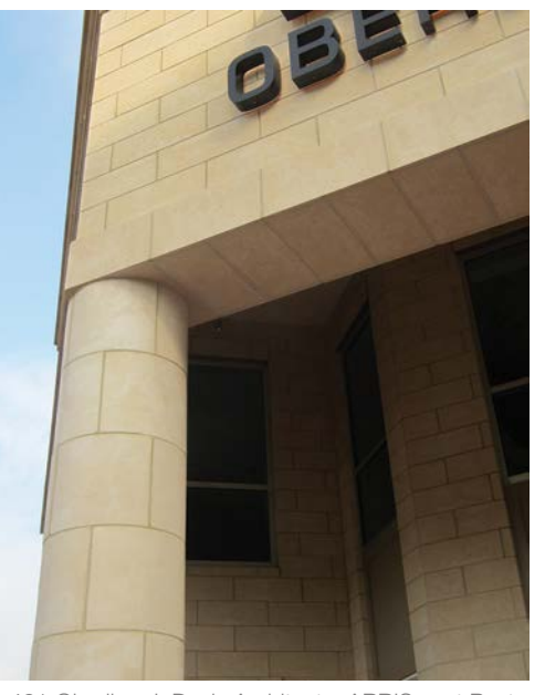
401 Oberlin; J. Davis Architects; ARRIS.cast Posts