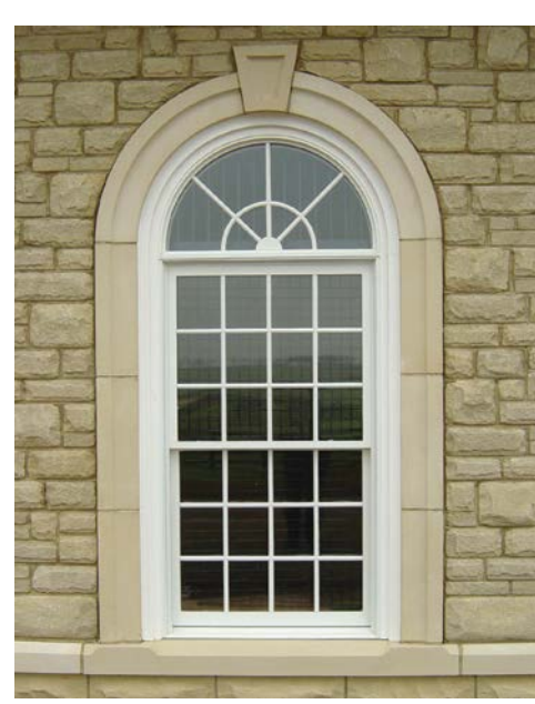
Adena Springs; Chapman Technical Group