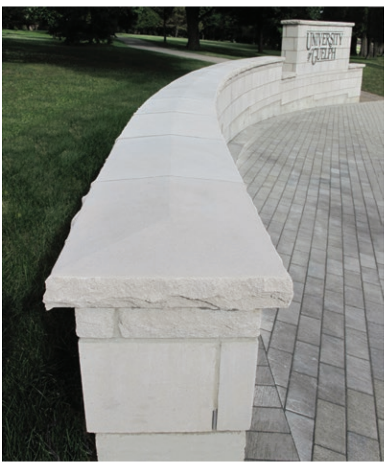
University of Guelph; ARRIS.cast Sloped Copings with Rocked Face

We're committed to helping you complete your project with the detail, quality and service you have come to expect from Arriscraft.