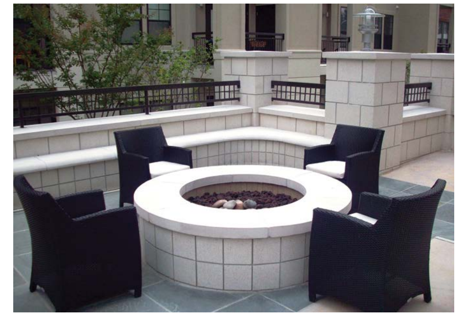
Elle of Buckhead; Niles Bolton Associates; ARRIS.cast Wall caps, Pier Caps, Firepit Cap