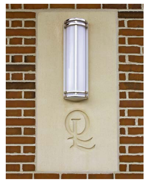
Quarry Lakes Office; Colimore-Thoemke Architects