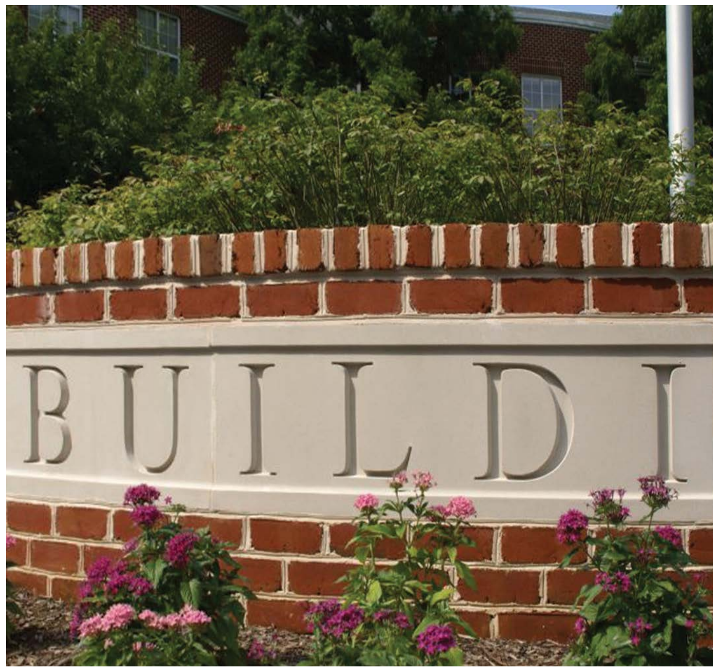
Greenspring Station; The Foxleigh Building Entry Sign