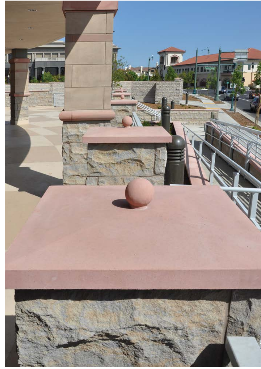
San Mateo Police Station; Leach Mounce; ARRIS.cast Caps and Finials