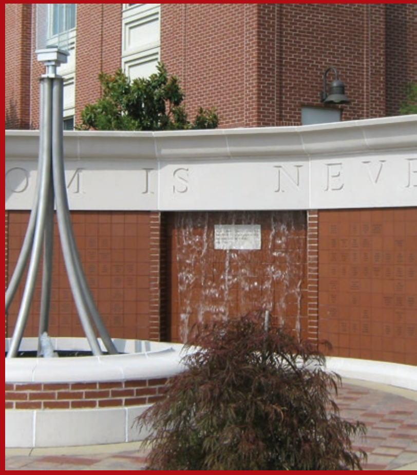
Snellville Memorial; CAS Architecture; ARRIS.cast Caps, Words, Fountain Cap & Base

6054 Zenith Mill Road, Arriscraft Lane Fort Valley, Georgia, USA 31030 Phone: 478-827-1896 Fax: 478-827-1897